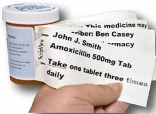
Large Print Labels

Anyone who has difficulty reading the printed information on a prescription label can request these labels at no cost.